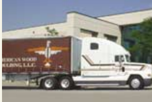
American Wood Moulding – United States of America.