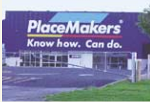
Placemakers – New Zealand.