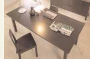
Zenia House, Denmark, Tenon's new partner in Europe.