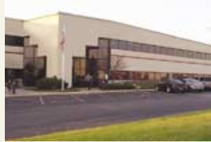
The Empire Company – United States of America.