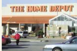
The Home Depot – 1,600 stores in the USA, Canada, Mexico and Puerto Rico.