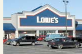
Lowe's – 875 stores in 45 states of the USA.